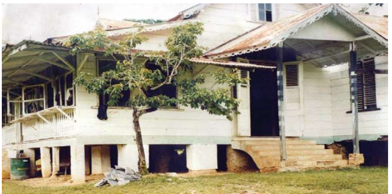
Front steps to Great House pre-1998 restoration