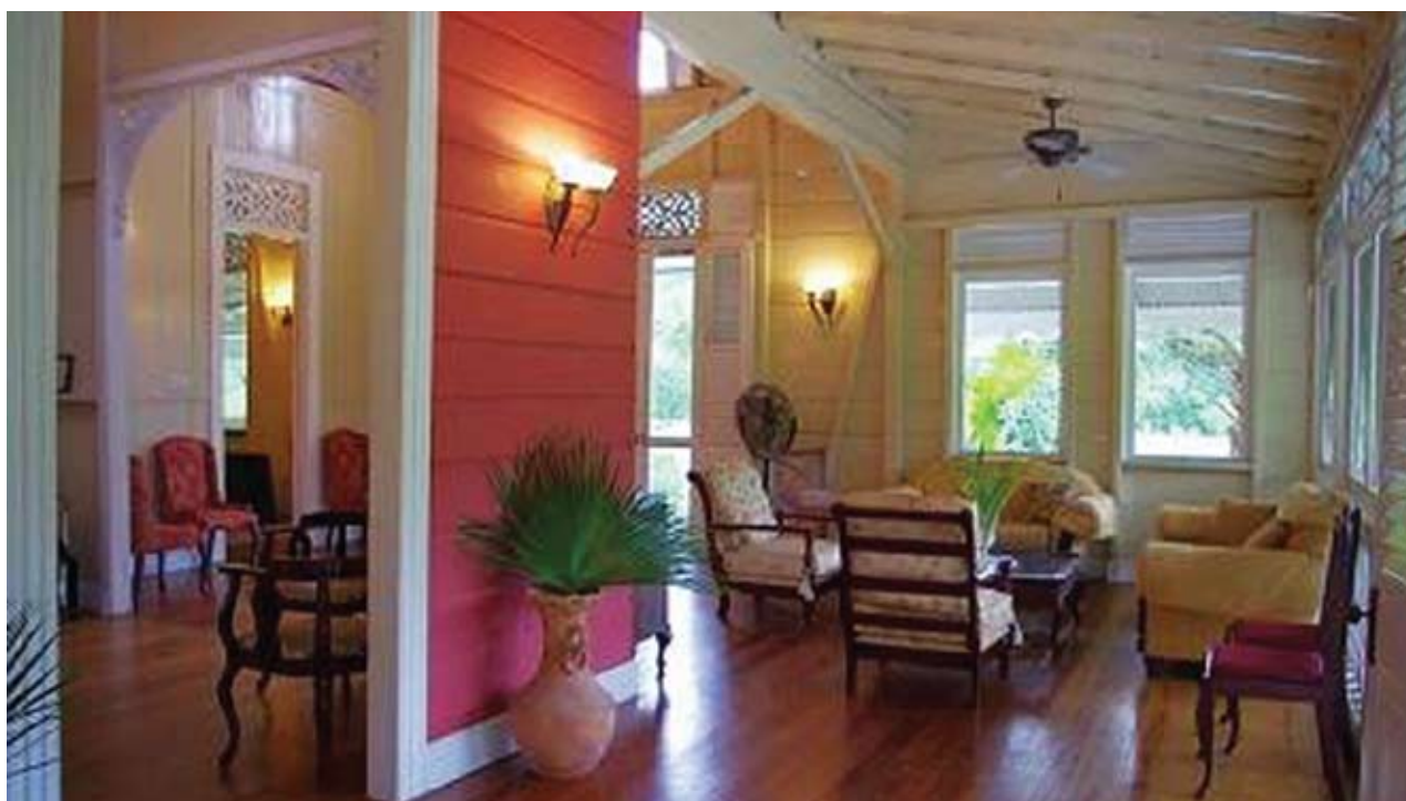
Restored Great House interior

Nestled in the lush Maracas Valley at St Joseph, the original Ortinola Estate spanned 430 acres or a Spanish colonial land grant between the years 1830 and 1840. The land was given to the Estate in the 1830s by the Crown. The Estate came to Trinidad in response to the Cedula of Population of 1809 from Spain. The Ciprianis came from a hamlet in