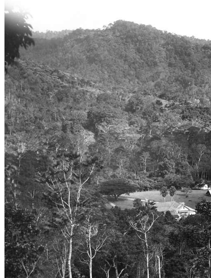
Ortinola in the 1920s

Nestled in the lush Maracas Valley at St Joseph, the original Ortinola Estate spanned 430 acres or a Spanish colonial land grant between the years 1830 and 1840. The land was given to the Estate in the 1830s by the Crown. The Estate came to Trinidad in response to the Cedula of Population of 1809 from Spain. The Ciprianis came from a hamlet in