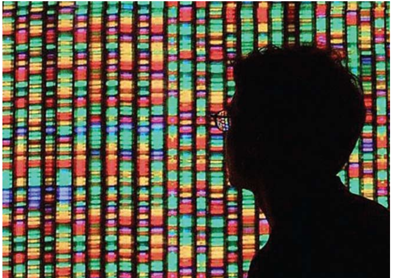
A person standing in front of a digital representation of the human genome

a good example is sickle cell disease, a disorder caused by the mutation of a single gene; or breast cancer which usually results from a series of mutations within a single cell.