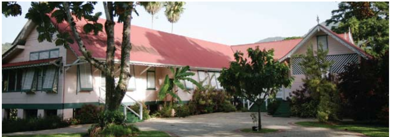
Back view of the Great House

Technical assistance has been provided for each component. The CRC partnered with CDE in rolling out and implementing the initial step of this project regionally as well as executing Components 1 and 2. Component 5 is being executed in partnership with IICA.