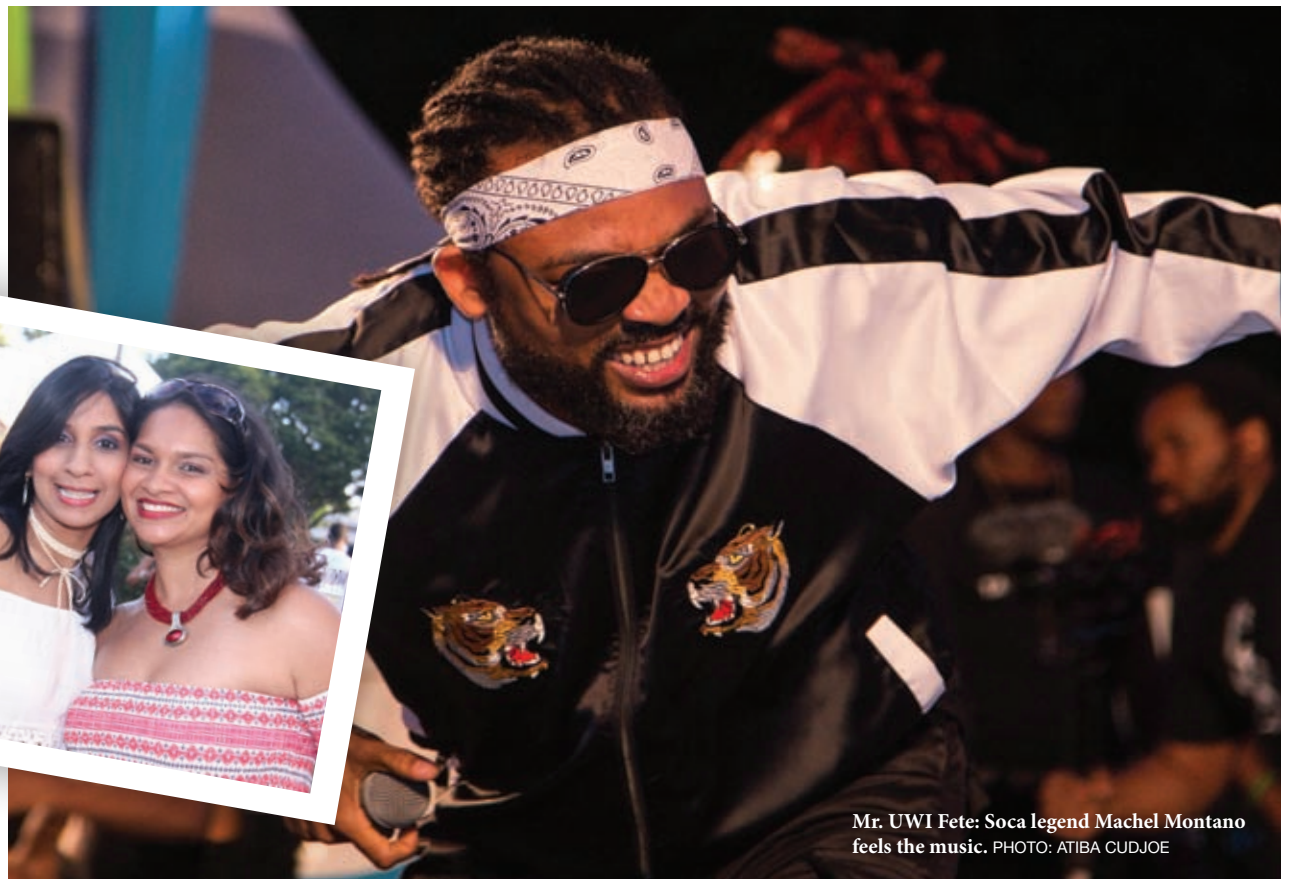
Mr. UWI Fete: Soca legend Machel Montano feels the music.