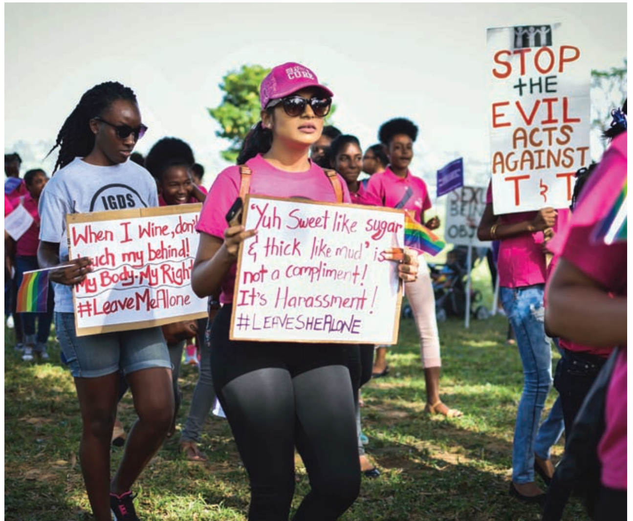
Pounding the pavement: Citizens of Trinidad and Tobago taking part in the Life in Leggings march.

The IGDS also collaborated with I95.5 to share messages across radio that would both raise consciousness about women's rights as well as call for communities to recognise leaders for gender equality in our midst. Statements broadcast included: "wherever they are, women have a right to be safe"; "the home isn't just women's responsibility, share the care"; "if a woman says no, walk away, sexual relations need consent"; "The state is responsible for