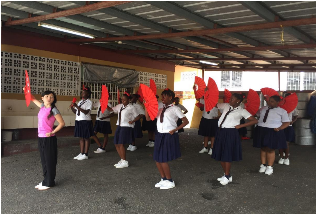
Tai Chi Fan demonstration