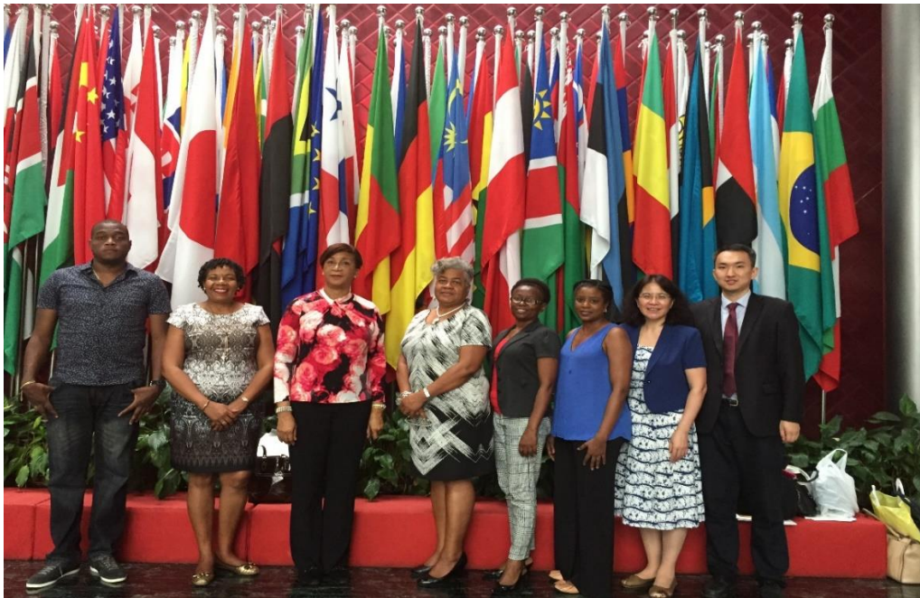
Participants of Educators' Tour to China