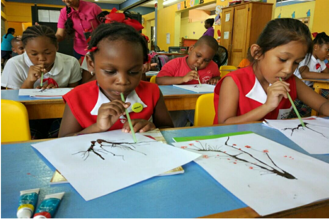
Chinese Ink Blow Painting