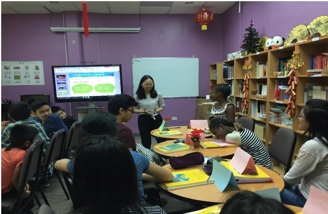
Chinese Heritage Class for Kids