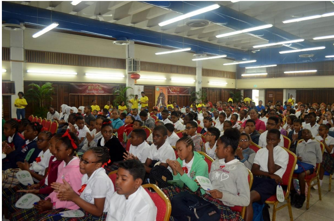
Opening ceremony of the Confucius Institute Day 2017 event