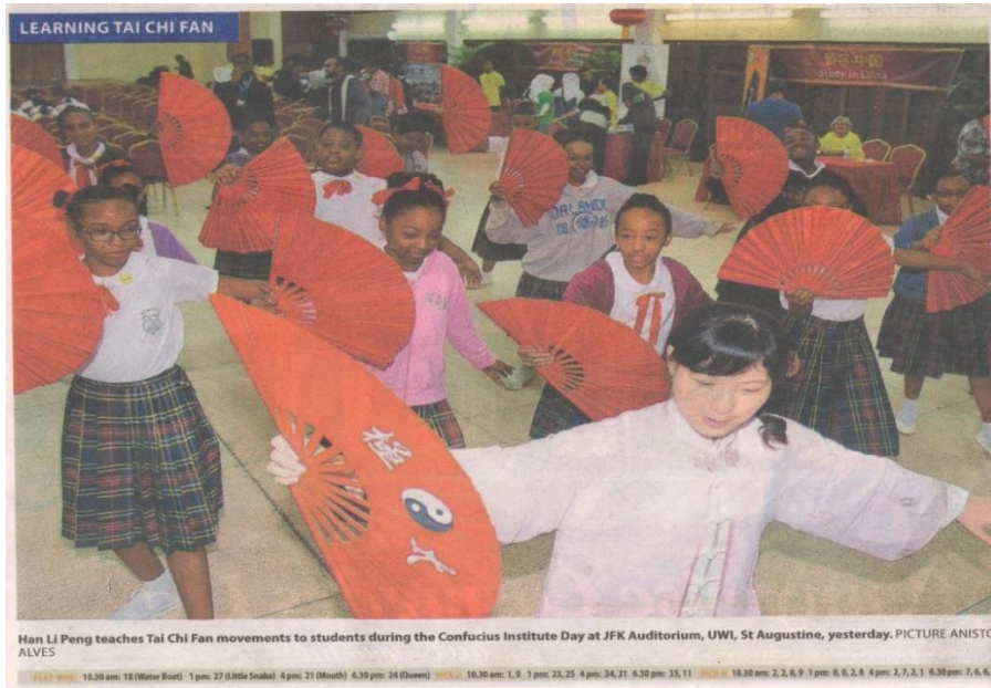
CI Day media coverage

http://www.hanban.org/confuciousinstitutes/node_39916.htm?vak=list