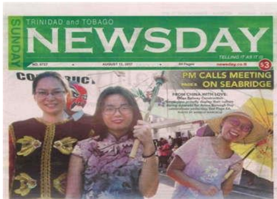
Arima Borough Day Parade