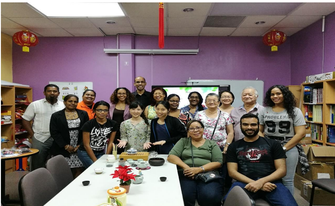
The Chinese Tea Appreciation Workshop