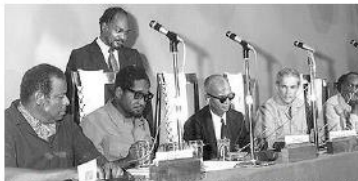
The leaders of the four founder countries of CARICOM (Barbados, Guyana, Jamaica and Trinidad and Tobago) signing the Treaty of Chaguaramas, which established what was originally the Caribbean Community and Common Market on 1 August 1973.