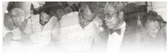
The leaders of seven Eastern Caribbean countries signing the Treaty of Basseterre, which established the OECS on 18 June 1981.