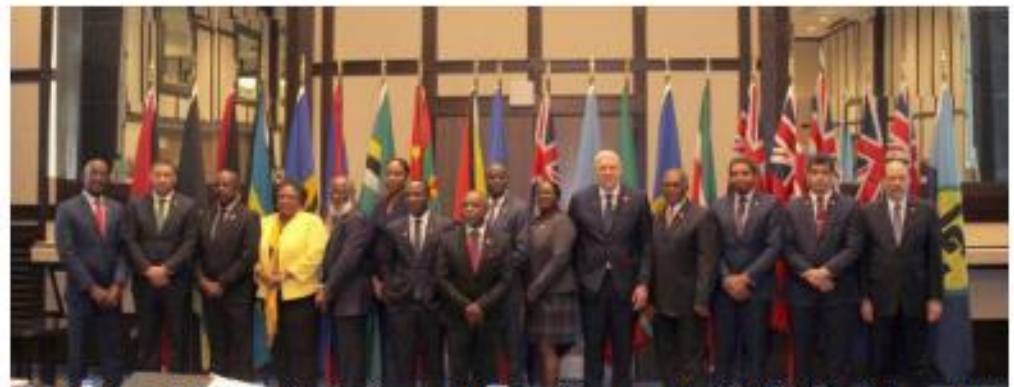
The 18th Special Meeting of the Conference of Heads of Government of CARICOM, which was held on 3-4 December 2018, approved the St. Ann's Declaration on CSME.