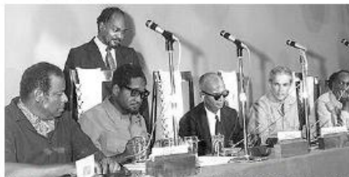
The leaders of the four founder countries of CARICOM (Barbados, Guyana, Jamaica and Trinidad and Tobago) signing the Treaty of Chaguaramas, which established what was originally the Caribbean Community and Common Market on 1 August 1973.