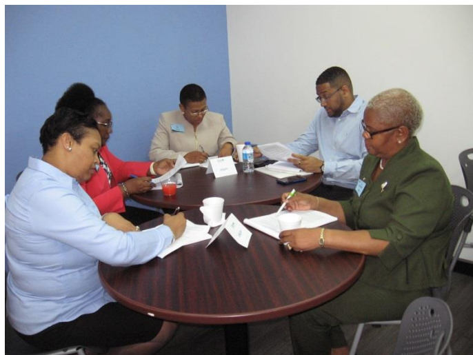
Groups engaged in activities