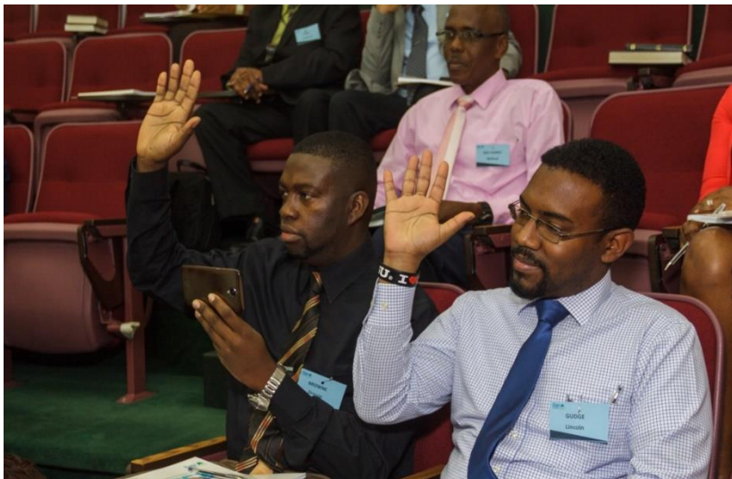
Active participation by two representatives of the University of the Southern Caribbean (USC)