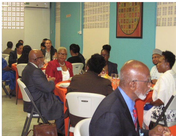
Formal Luncheon and Dining Etiquette Exercise