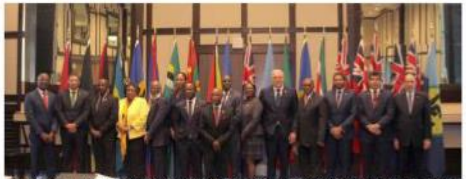
The 18th Special Meeting of the Conference of Heads of Government of CARICOM, which was held on 3-4 December 2018, approved the St. Ann's Declaration on CSME.