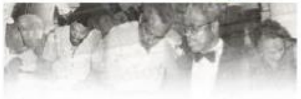
The leaders of seven Eastern Caribbean countries signing the Treaty of Basseterre, which established the OECS on 18 June 1981.