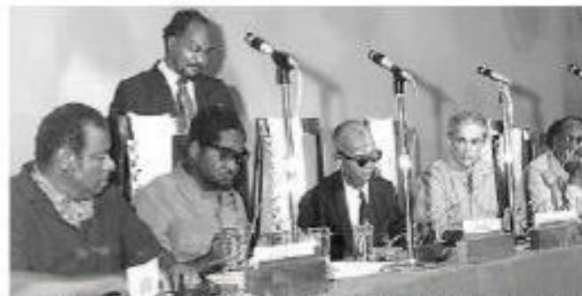
The leaders of the four founder countries of CARICOM (Barbados, Guyana, Jamaica and Trinidad and Tobago) signing the Treaty of Chaguaramas, which established what was originally the Caribbean Community and Common Market on 1 August 1973.