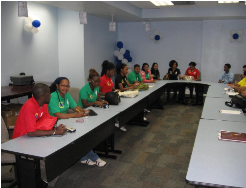
Initial briefing session, Ministry of Finance Grenada