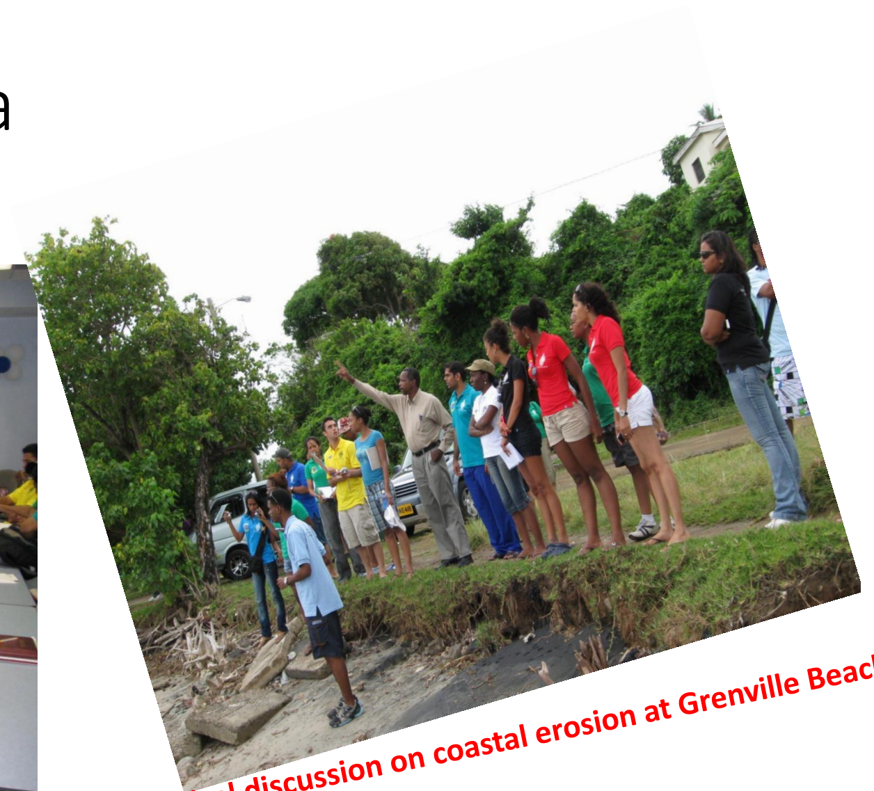
Technical discussion on coastal erosion at Grenville Beach