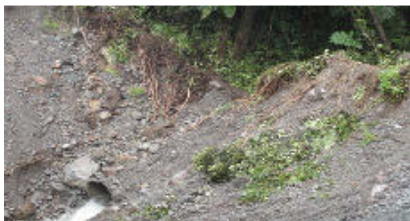
Figure 9. Remains of the culvert at the upstream end

Furthermore, the shape of the three post failure cross sectional profiles (0+087, 0+089 and 0+091) seems to indicate an overflow. It is hoped that a geotechnical analysis/numerical simulation may resolve this contradiction. This then, is another area for further investigative work.