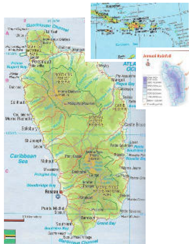
Figure 1. Dominica: An island in the Lesser Antilles

Dominica is a mountainous island where precipitation is dominated by its orography (see Figure 1). Indeed, it is considered a natural laboratory to study tropical meteorology (Smith et al. 2012).