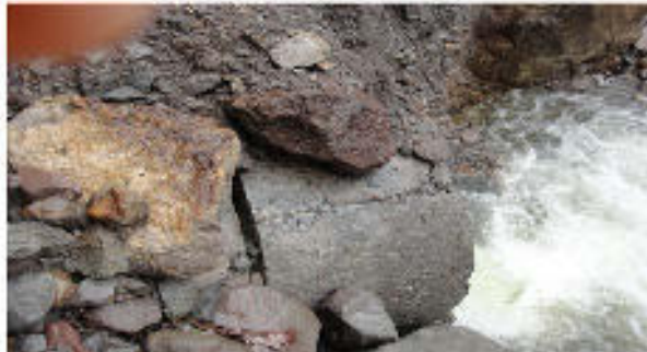
Figure 6. A photo showing dislocated culvert joints

culvert pipe segments some time prior to the event. This observation underscores the need for a regular inspection, and preventive maintenance of bridges and culverts. Besides, the inlet structure (see Figure 8) and upstream segments of the culvert remained intact (see Figure 9) and give credence to the argument that an overflow did not take place.