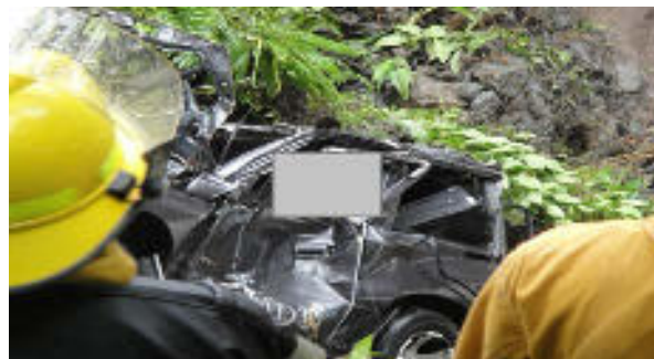
Figure 7. A photo showing gabion baskets at the culvert outlet