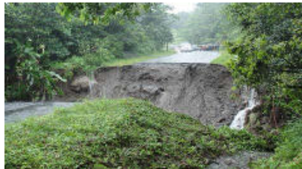
Figure 3. A photo showing a collapse of a road at Pont Cassé

Thus, if we scale the Melville Hall Daily Rainfall of 129 mm on 18th April 2013 to Pont Cassé, we arrive at figures which are close to a 100 year 24 hour rainfall at an orographically similar location in Puerto Rico (US Department of Agriculture 1961). Further, although a temporal distribution of the rainstorm is not known, a cloudburst and flash flood cannot be ruled out. Indeed, there is a record of a cloudburst rain of 198.12 mm in 15 minutes at Plumb Point in Jamaica in 1916 (WMO, 2009). However, a cloudburst (defined as rainfall intensity greater than 100 mm/h over a short duration) is almost an unknown meso-scale weather system throughout the world; since rain-gauge networks generally are unable to capture it due to its highly localised occurrence (Thayyen, 2013). Figure 3 shows a photo taken on a collapse of a road at Pont Cassé on 19th April 2013.