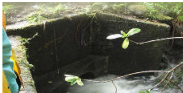
Figure 8. A photo showing the culvert inlet