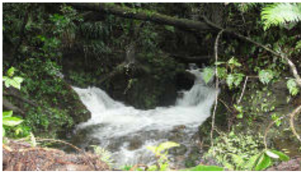
Figure 4. The stream at Pont Cassé

which occurred during the breach of the road on the morning of Friday 19 th April 2013. It does so by a combination of Global and Regional Flood Frequency Analyses (DHV Consultants, 1998, Meigh et al., 1997). Specifically, Mean Annual Flood (MAF) is estimated first and it is then scaled up for higher return periods. For estimating MAF a regression equation for West Africa ( \leq 8^{\text{th}} N) is selected, since in the author's experience its hydrology is similar to that in the Caribbean. This perhaps should not be surprising, since Caribbean Weather Systems normally originate off the coast of Africa. The MAF equation includes the catchment area (AREA) as well as the Average Annual Rainfall (AAR), and gives an MAF of approximately 2 \text{ m}^3 \text{ s}^{-1} for the stream at Pont Cassé (see Figure 4) for an AREA = 0.5 \text{ km}^2 and AAR of 6,645mm.