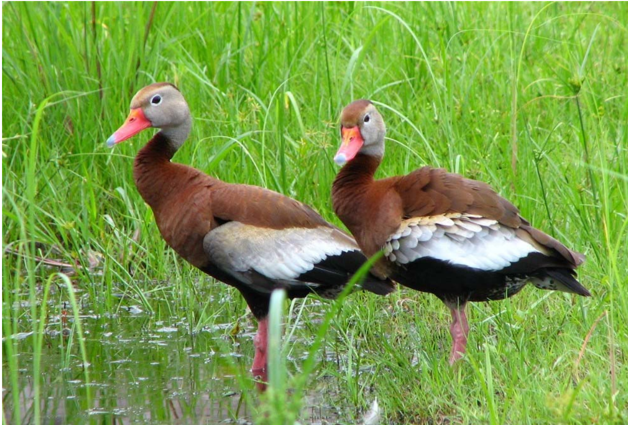
Fig. 1. Black-bellied whistling duck, Dendrocygna autumnalis .

[ http://www.bamboo4u.com/black-bellied_whistling_ducks_7-20-08.htm , downloaded 7 November 2012]