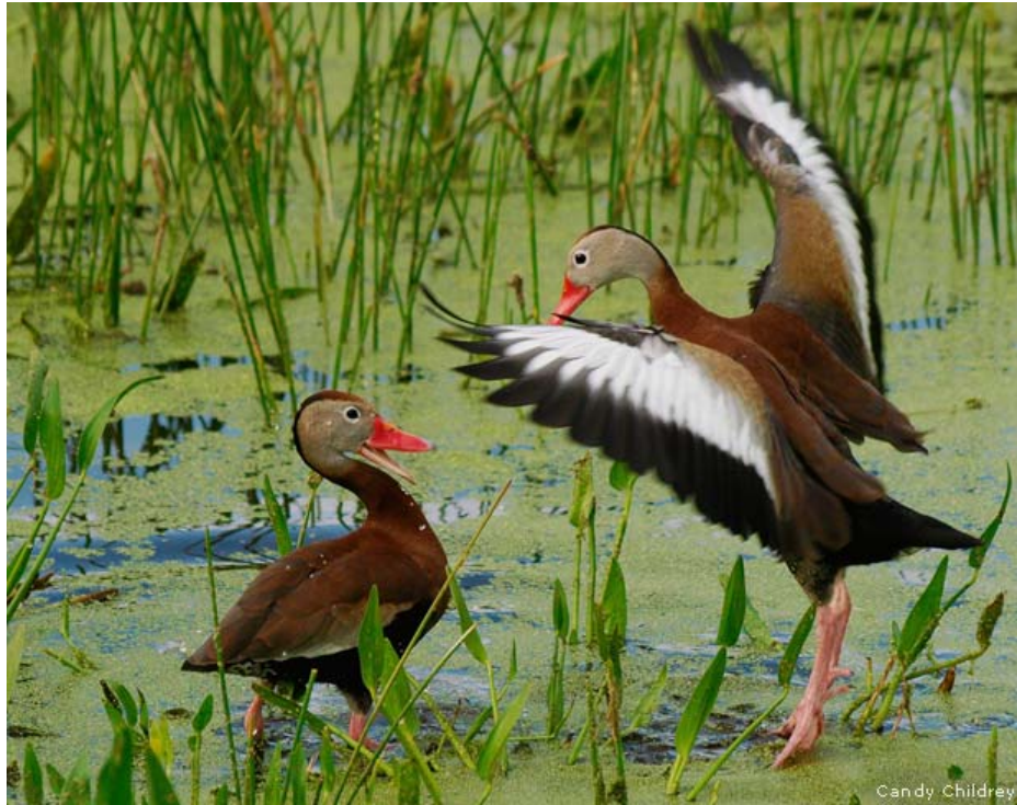
Fig. 2. Two black-bellied whistling ducks in a marsh.