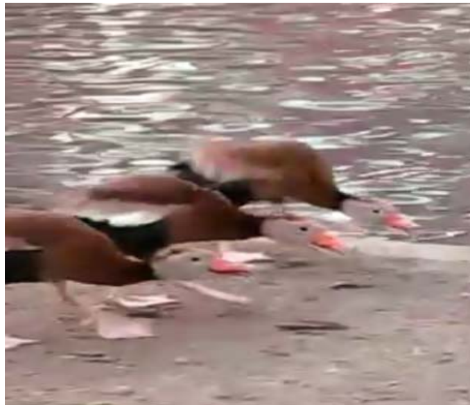
Fig. 5. Three D. autumnalis preparing to attack a predator.