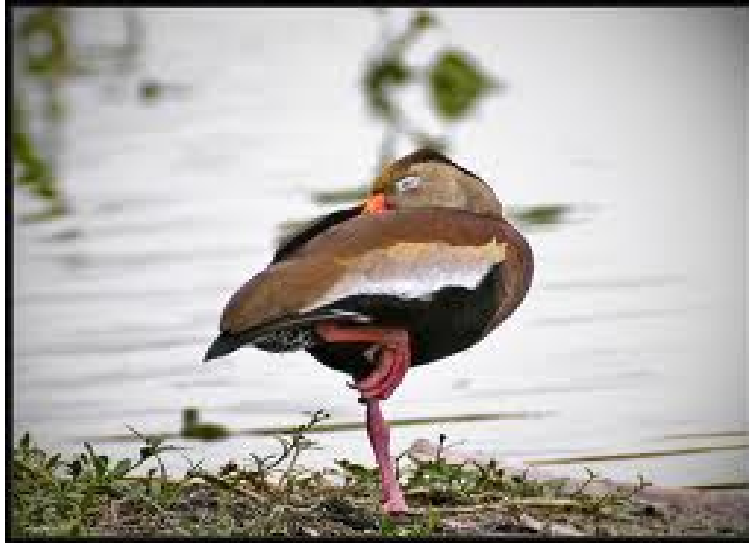
Fig. 4. Adult D. autumnalis asleep while standing.