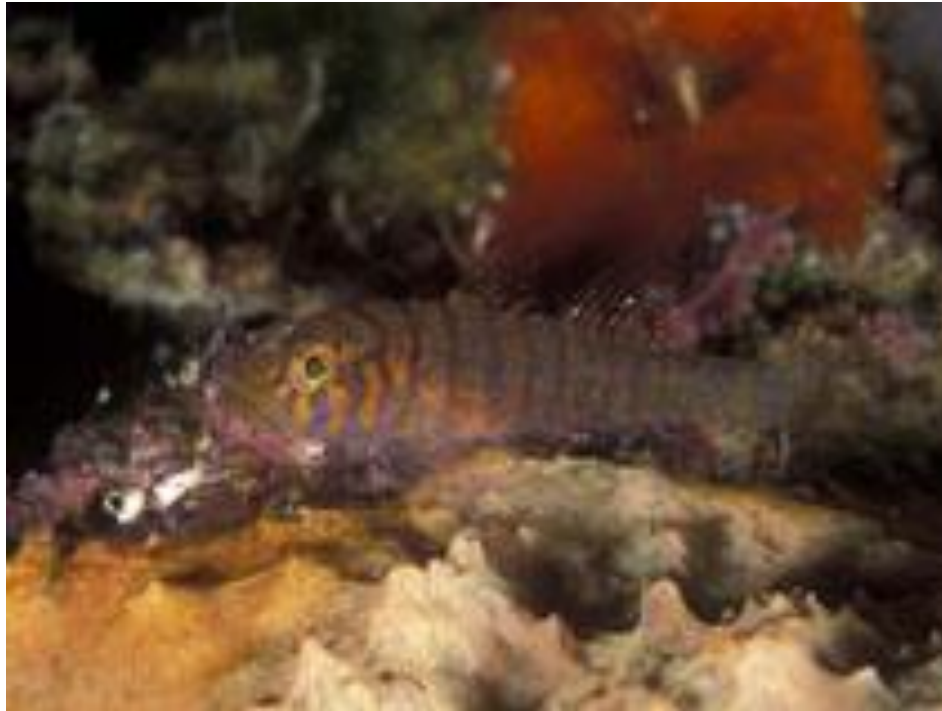
Fig. 4. Spotwing goby in its habitat.

[ http://www.fishbase.org/summary/3888 , downloaded 18 February 2017]