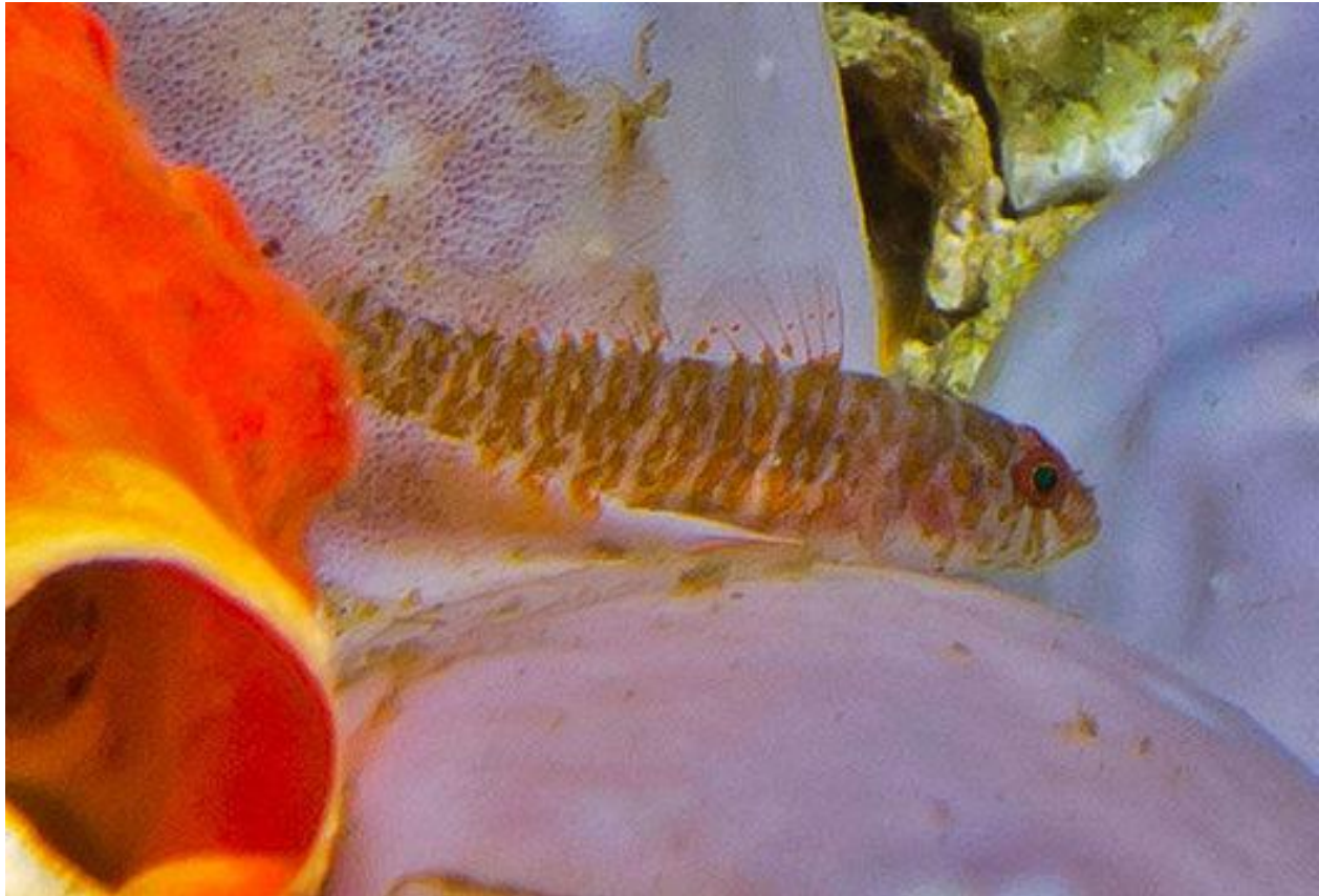
Fig. 1. Spotwing goby, Lythrypnus spilus .