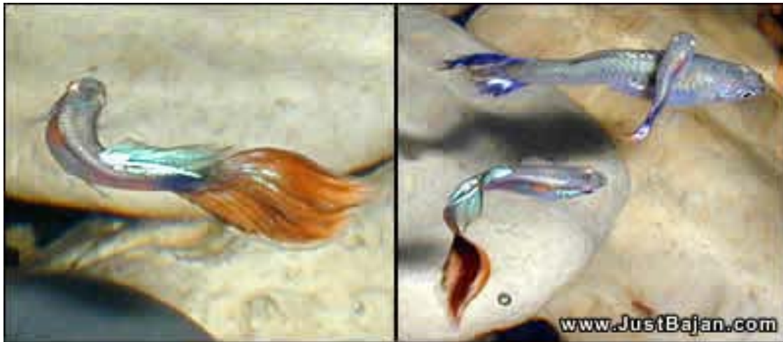
Fig. 3. Courtship display in male guppies (sigmoidal display).

[ http://www.fishforums.net/index.php?/topic/200028-hybrids-of-mine-gambusia-affinis-x-poecilia-recticulata , downloaded 14 November 2011]