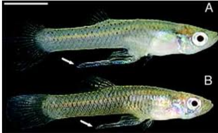
Fig. 2. Gonopodium structure of male guppy.

[ http://www.fishforums.net/index.php?/topic/200028-hybrids-of-mine-gambusia-affinis-x-poecilia-recticulata , downloaded 14 November 2011]