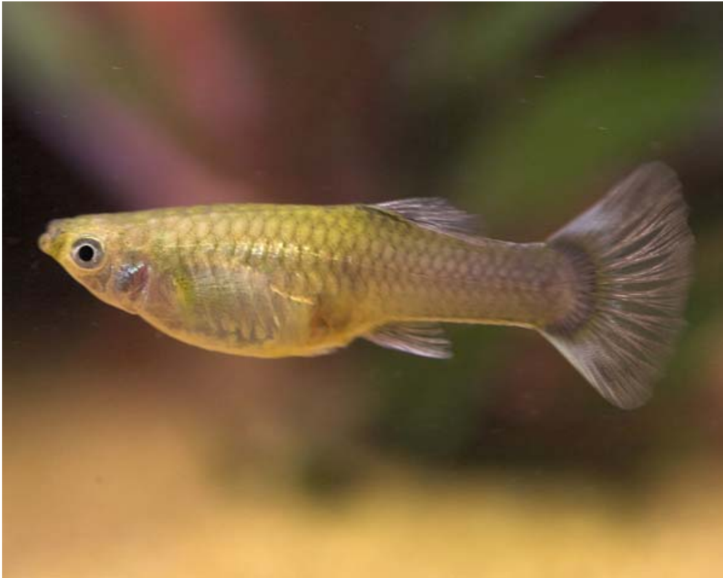
Fig. 1. Female guppy, Poecilia reticulata .

[ http://www.breeding-guppies.com/images/62364260.DlmpoMRh.IMG_072801.jpg , downloaded 25 October 2011].