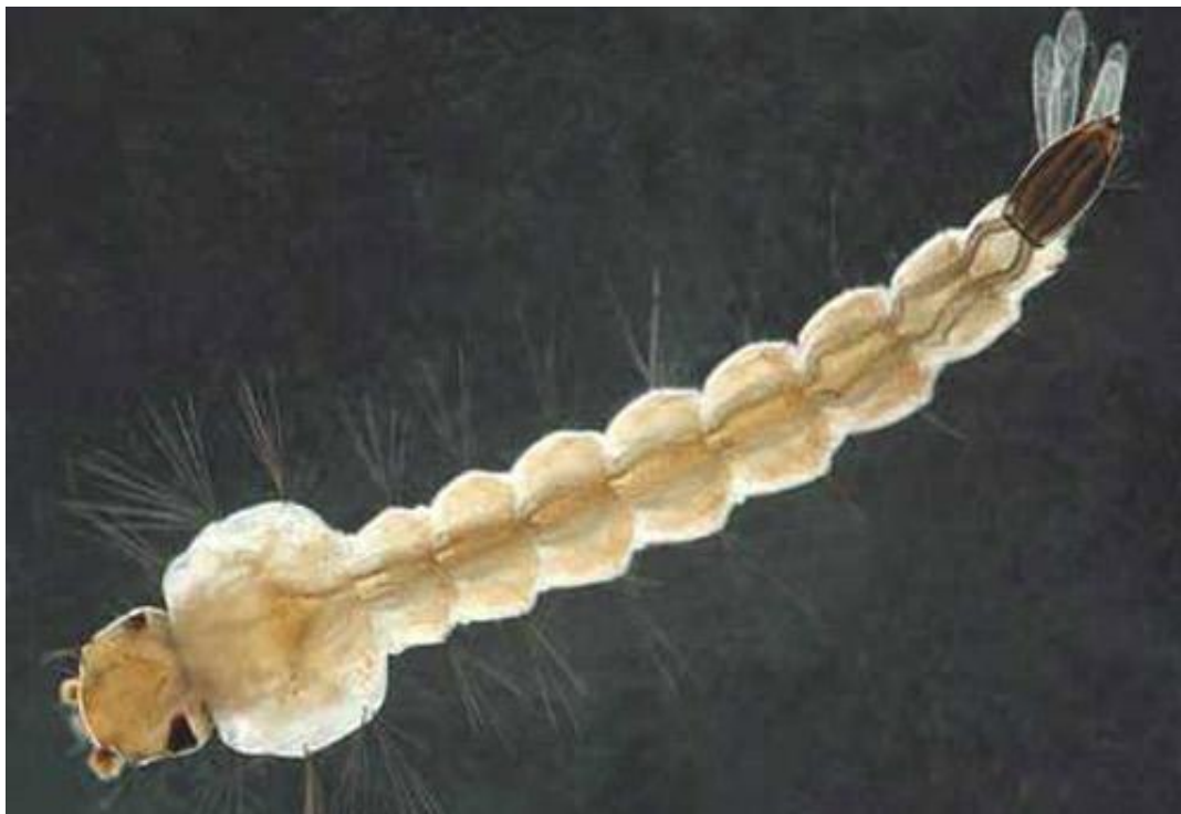
Fig. 4. A larva of the Asian tiger mosquito, Aedes albopictus .

[ http://reference.medscape.com/features/slideshow/vhf , downloaded 20 February 2015]