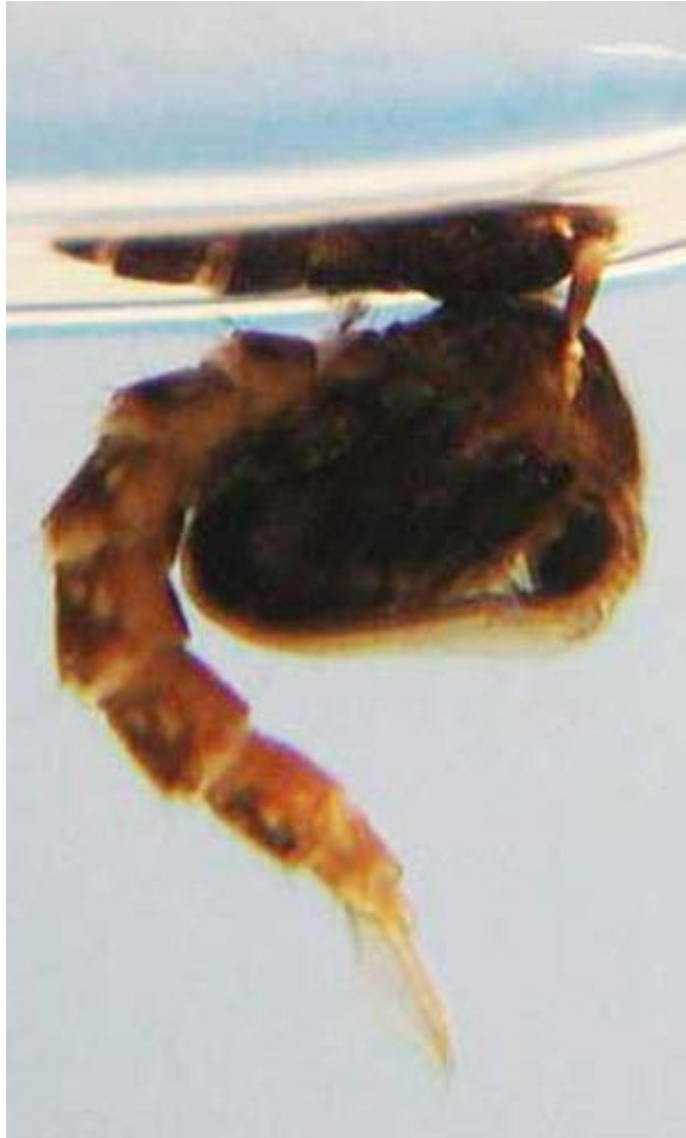
Fig. 5. A pupa of the Asian tiger mosquito, Aedes albopictus .

[ http://entnemdept.ufl.edu/creatures/aquatic/asian_tiger.htm , downloaded 23 February 2015]