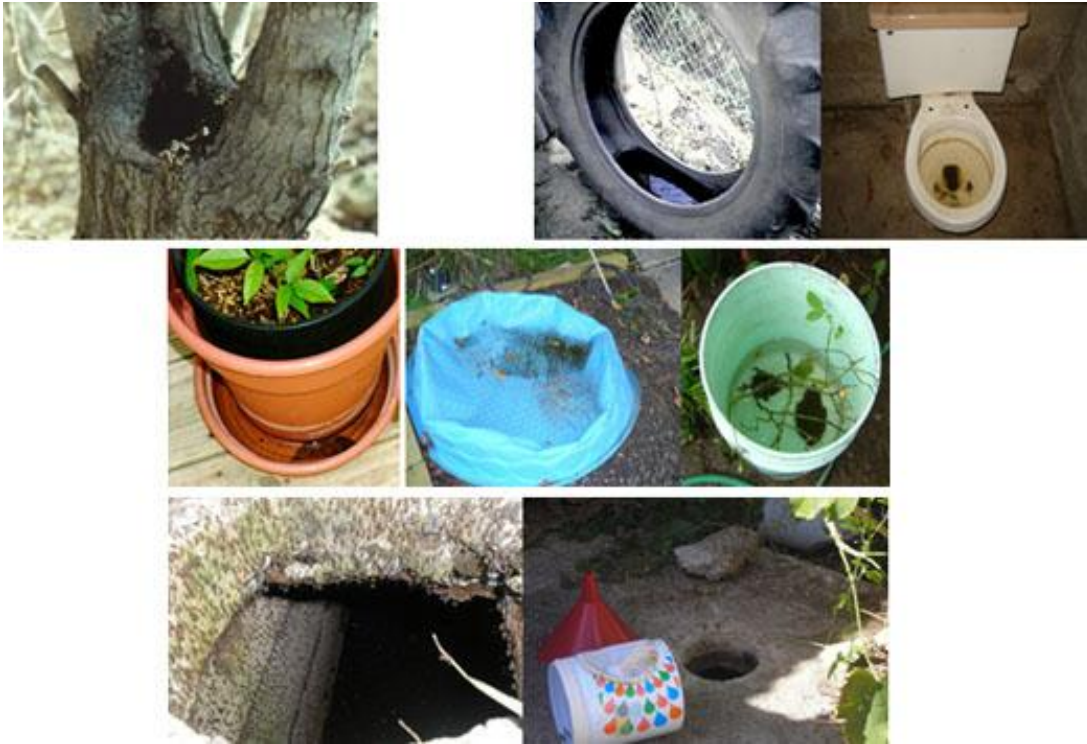
Fig. 3. Habitats of the Asian tiger mosquito, Aedes albopictus , in urban areas.

[ http://reference.medscape.com/features/slideshow/vhf , downloaded 20 February 2015]