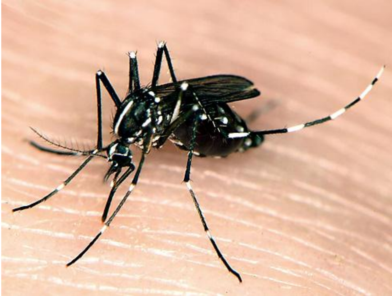
Fig. 1. Asian Tiger Mosquito, Aedes albopictus .

[ http://civr.ucr.edu/asian_tiger_mosquito.html , downloaded 16 February 2015]