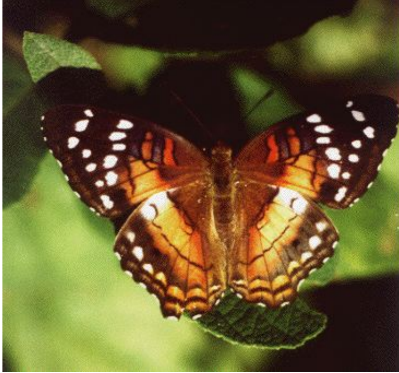
Fig. 2. A female Anartia amaethea with the characteristic orange coloration.

[ http://www.chebucto.ns.ca/environment/NHR/lep_images.html downloaded 14 September 2012]