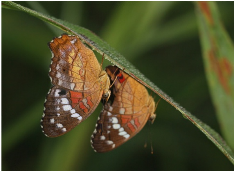
Fig. 3. Two Anartia amathea roosting on the underside of a blade of grass.

[ http://www.chebucto.ns.ca/environment/NHR/lep_images.html downloaded 14 September 2012]