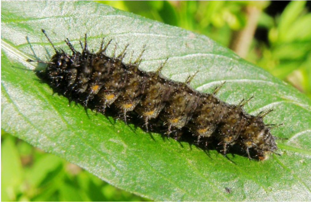
Fig. 4. The caterpillar of Anartia amathea .

[ http://www.pybio.org/en/18808/galeria-de-larvas/ downloaded 14 September 2012]