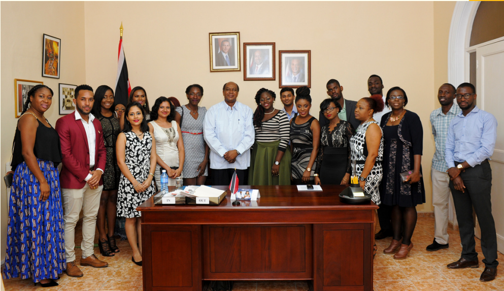
Students of the IIR visit to the Trinidad and Tobago Embassy in Cuba