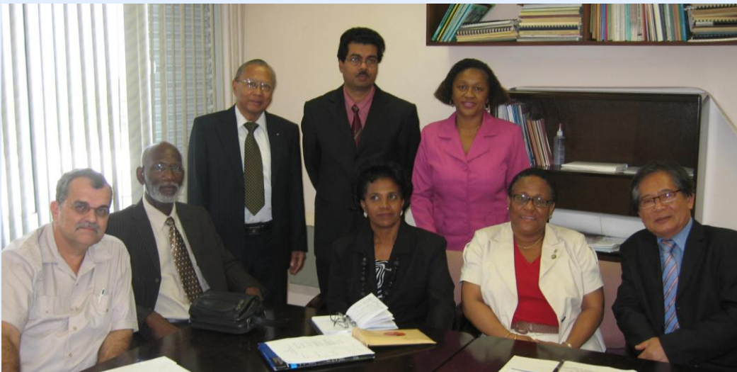
The Principal and Deputy Principal of the UWI Open Campus (2 nd & 3 rd from right) pose with the official delegation from the Anton de Kom University in Suriname.