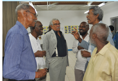
Noble Laureate, Hon. Derek Walcott and friends chatting about the 'good old days'.