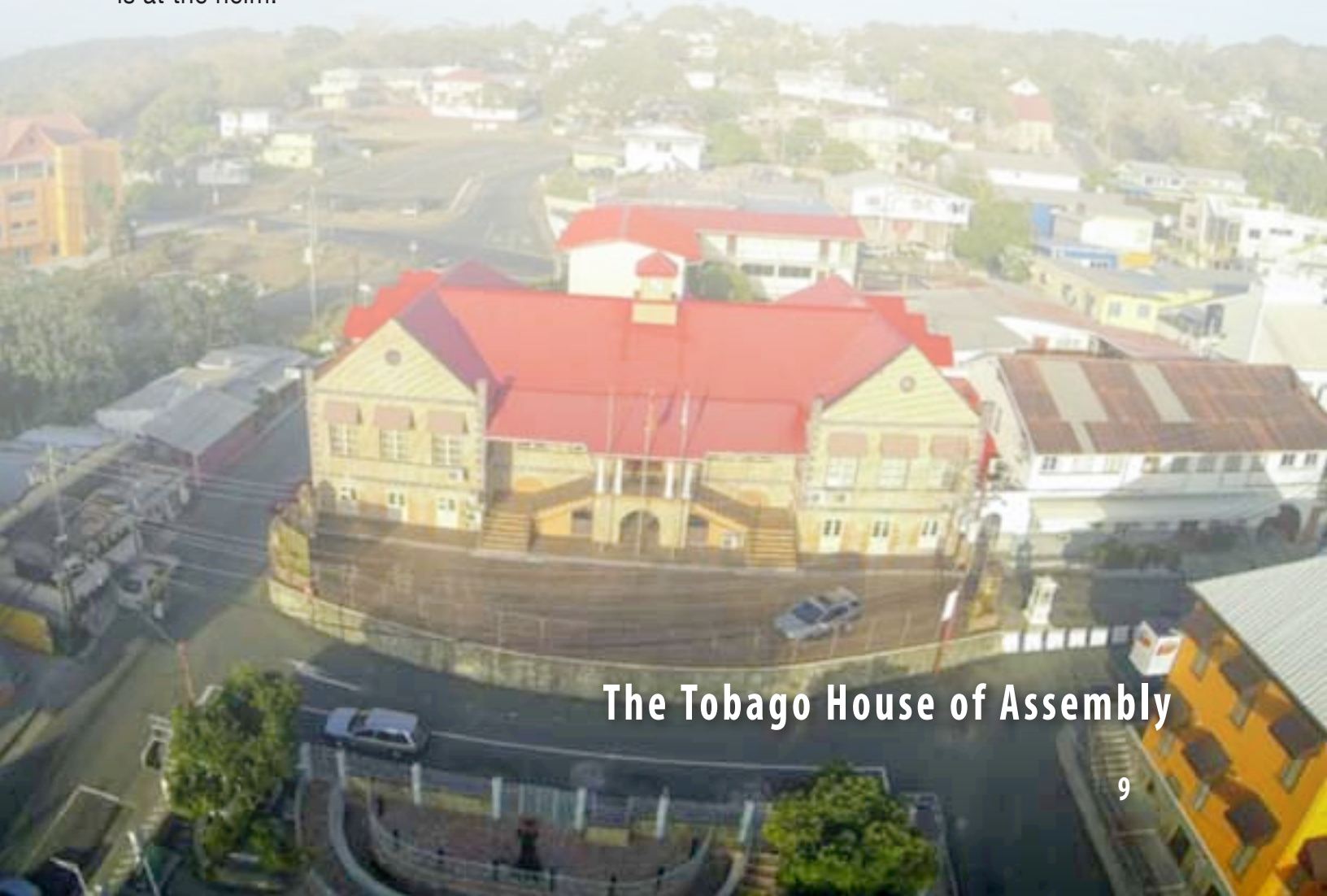
The Tobago House of Assembly

The modern THA has 12 seats, and unlike the original body, is open to any Trinbagonian residing in Tobago. After 1980, the THA formed itself into seven divisions each representing a developmental concern. Today the THA comprises two main arms: the Legislative Arm and the Executive Arm; along with 10 divisions including the Office of the Chief Secretary which is at the helm.