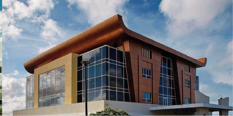
CAVE HILL CAMPUS