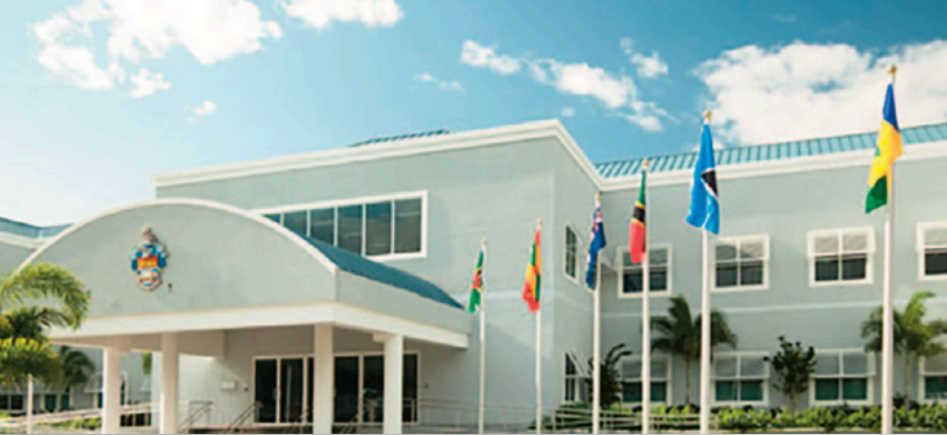
THE UWI REGIONAL HEADQUARTERS