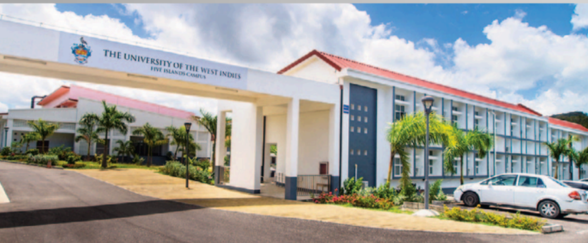
FIVE ISLANDS CAMPUS