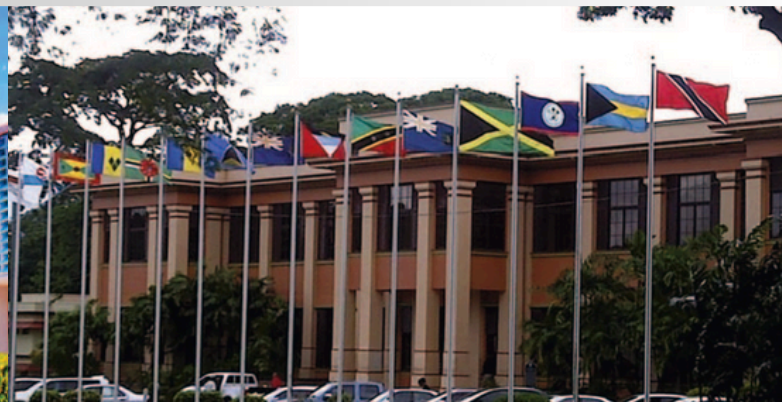
ST. AUGUSTINE CAMPUS