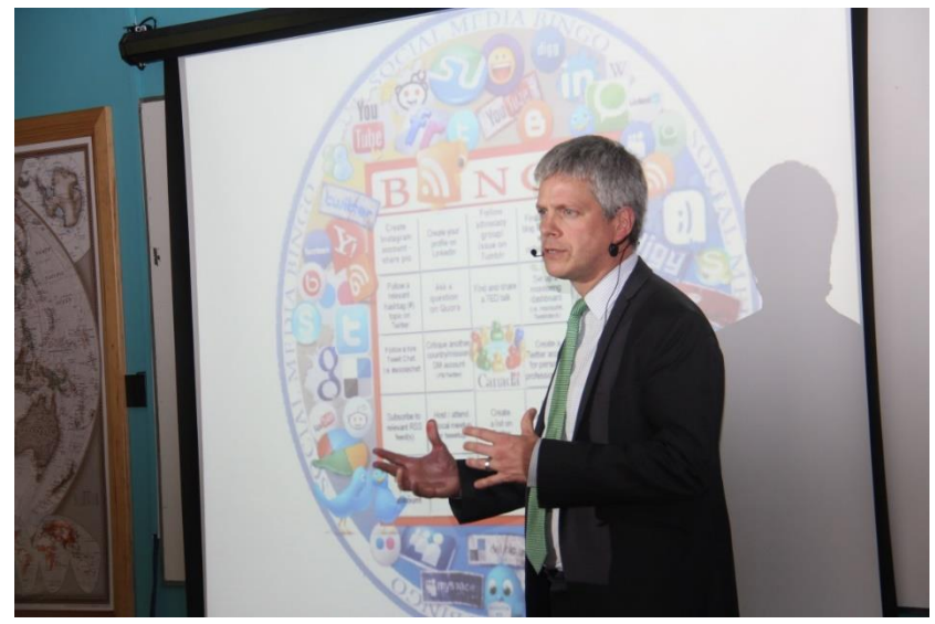
Ambassador Ben Rowswell engages participants in a game of Social Media Bingo.

Module 2, Session 7: Protocol and Diplomatic law: Rules and Procedure November 2<sup>nd</sup> – 9<sup>th</sup>, 2015