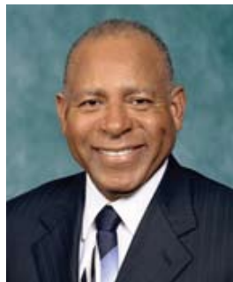
The Honourable Prime Minister Patrick Manning

A wide range of speakers and participants will address the conference. The Honourable Prime Minister Patrick Manning will provide the initial impetus followed by panel discussions and paper