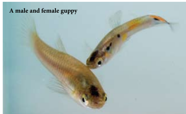
A male and female guppy

The researchers do not know exactly why sexual harassment from males has such a marked effect on female social interaction. They speculate it is possible that the sheer amount of time spent by females dealing with unwanted male attention prevents them from forming relationships with other females. They believe females from groups with more males may have bonded with females from outside in order to try to establish themselves in a more favourable environment.