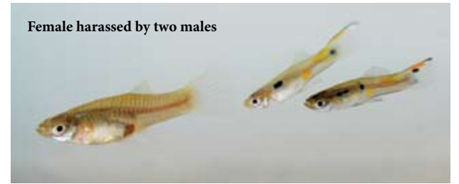
Female harassed by two males

If you can imagine the implications of a 1994 study showing that female guppies “may experience up to one forced copulation attempt (a sneaky mating) from males every minute” and how it makes them miss out on feeding opportunities, you might understand why researchers delved even deeper into the sexual behaviour of guppies.