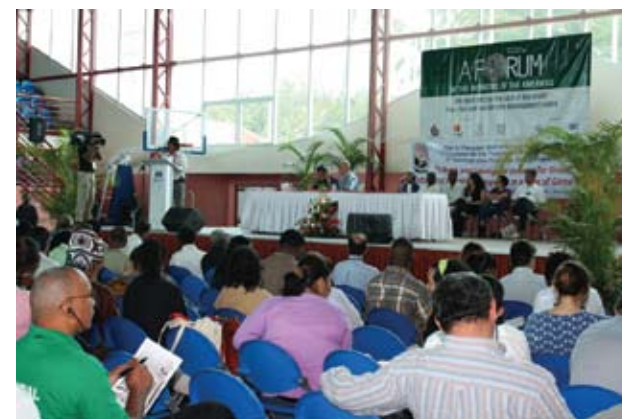
Several Caribbean and Latin American groups were part of the social movements attending the Workers' Forum of the IV Peoples' Summit of the Americas held at The UWI in April.

terms of what kind of society we wish to build. If we want to have a society dealing with equity and social justice, then employers' associations, business groups, cannot condone their members violating the Minimum Wage Law or the Maternity Act. It has to mean that the Government cannot use Chinese or non-Caricom labour on projects when local labour is being shelved. Until we don't change our position on those things, we can't come to the table and talk.