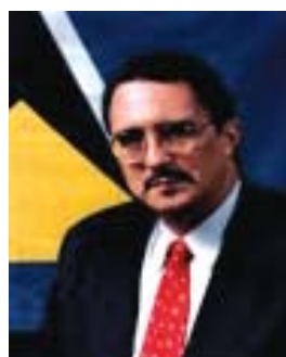
Dr Kenny Anthony