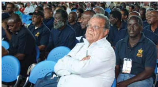
Members of the audience at the Workers' Forum, which kicked off the IV Peoples' Summit of the Americas held at The UWI in April. Few students attended.