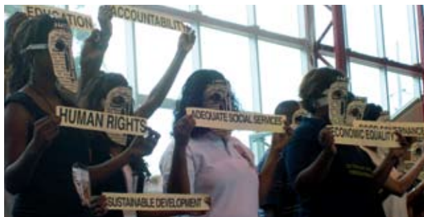
Demanding Accountability in Public Spending: Feminist student group 'Consciousness Raising' makes a statement at the Rally held at the Sport and Physical Education Centre (SPEC) as part of the IV Peoples' Summit of the Americas held at The UWI in April.

Before we come together to have a social compact, you have to have some kind of framework, an agreement in