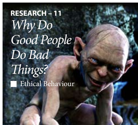
RESEARCH – 11 Why Do Good People Do Bad Things? ■ Ethical Behaviour