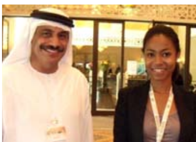
CAMPUS NEWS – 05 Fiery Ice in Dubai ■ A Future Source of Energy

This year, the students took full advantage of the building and grounds and they exhibited paintings, sculpture, installations, photography, handbags and lamps among many other works of art and design that they produced for their final evaluation. Students from Design, Art Studio, Fine Art, 3-Dimensional Design and Certificate level courses took part. (see centrespread)