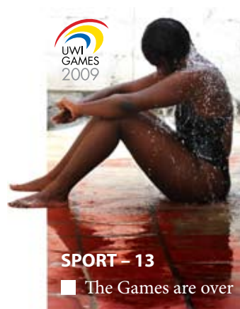
SPORT – 13 ■ The Games are over