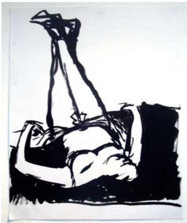
Figure drawing study by Camille Harding

As we stepped out of our room, we'd be facing the central square courtyard of the building where we were staying. It was a small square of space cut right through the two stories of the structure. It was therefore possible to stare up into the sky or towards taller, adjacent buildings, such as the one featured in the photograph at right. The shot at left would have been taken fairly early on any of the mornings before we set out for the day. The arch and corrugated black shapes framing the shot are the arch and green galvanized roof (respectively) of the hotel we were in. So it's looking up diagonally through the central courtyard. At night it was bathed in dusk and the small amber of someone's room's light would peek through the rectangular window. It was wonderful. It made me think of Aladdin, running across rooftops... the rooftop prince... The picture above is located along a long, paved area where people jog and walk and children play baseball with crown corks. The feeling you get there is Brian Lara Promenade/Brooklyn, with trees of various sizes. It's lined by ancient buildings, many of which are apartment complexes with four or seven people living in one apartment.