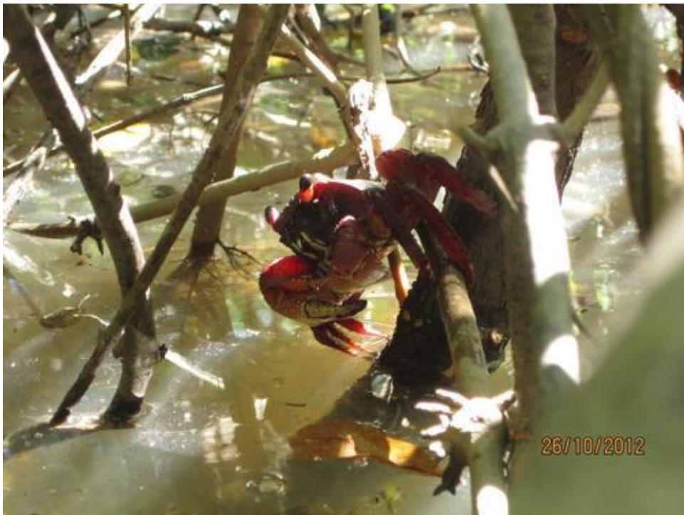
Fig. 4. Mangrove root crab climbing mangrove roots.