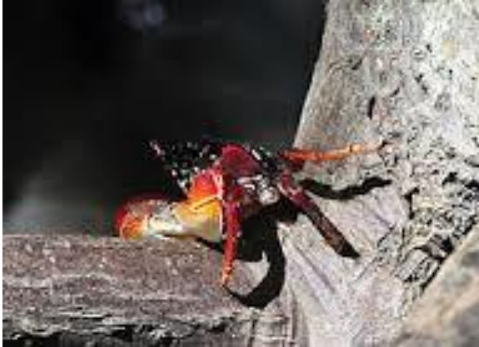
Fig. 3. Mangrove root crab in a tree during the day.

[ https://www.flickr.com/photos/24580998@N08/3331527594 , downloaded 2 March 2016]