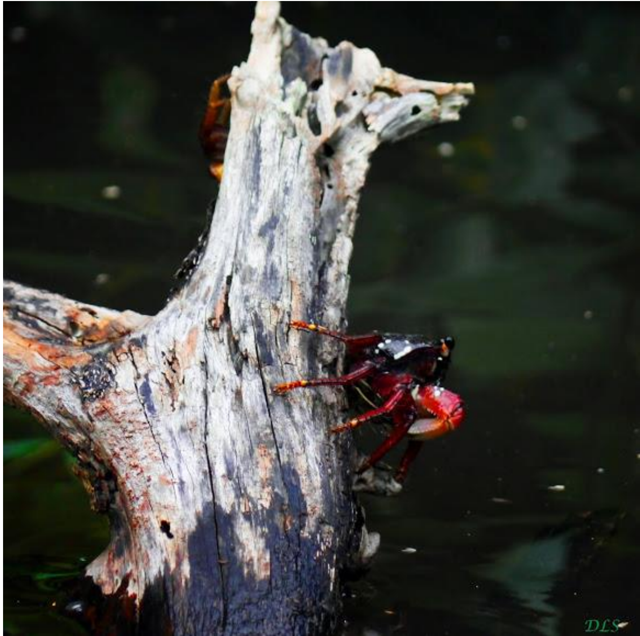
Fig. 5. Mangrove root crab spotted from a boat at Caroni swamp, Trinidad.

[ http://www.projectnoah.org/spottings/19484206 , downloaded 2 March 2016]