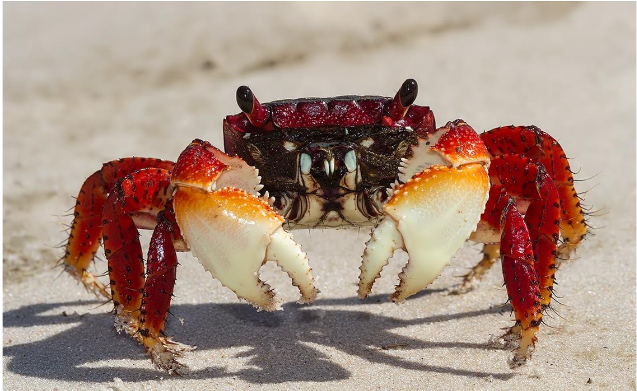
Fig. 1. Mangrove root crab, Goniopsis cruentata .